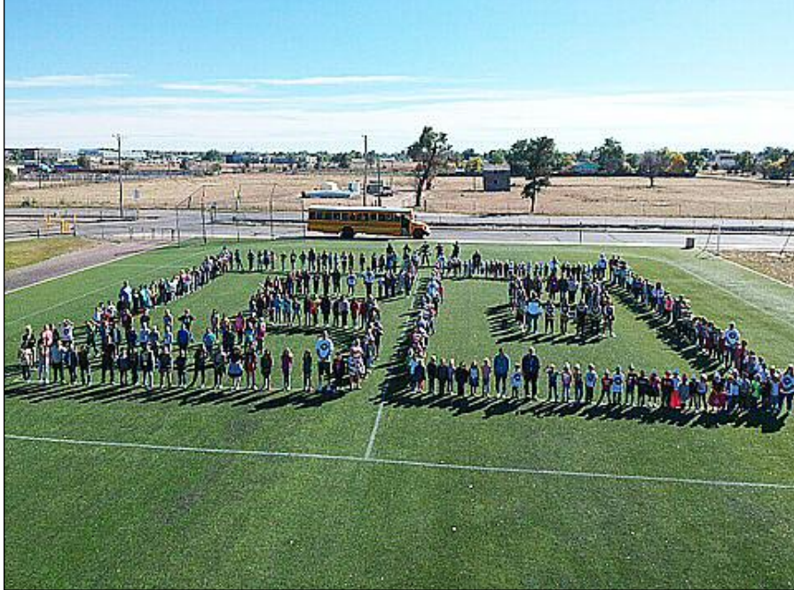
Henderson Elementary School students form a 50 on the school's playing field to mark the 50th anniversary of the school, which opened in 1968. The community anniversary celebration was held Oct. 13.